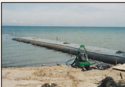
Geotube® containers being positioned to create groyne for shrimp farm inlet.

Because Geotube® units can be custom sized, groyne applications can be designed for optimum performance. Geotube® units can be filled with sand from the area when allowed, simplifying the construction process. If regulations require fill material to come from another location, the units can still be filled less expensively than other construction methods.