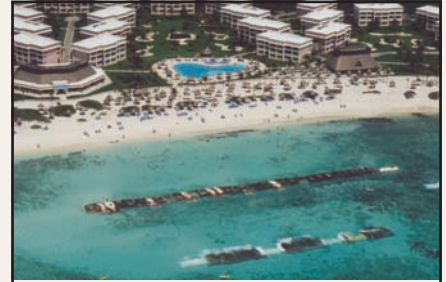
Geotube® unit placed offshore for use as a breakwater.

By using Geotube® technology to change wave patterns, millions of dollars have been saved in reduced property damage or expense for renourishing beaches.