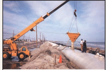
Geotube® unit being filled with sand using a hopper.

In fact, one of the advantages of Geotube® geocontainment technology is that the gentle original slope of the beach can be recreated. This improves the aesthetics of the shoreline and also aids wildlife by providing a natural-seeming habitat—and blocking lights from shore that can confuse sea turtles and other creatures.