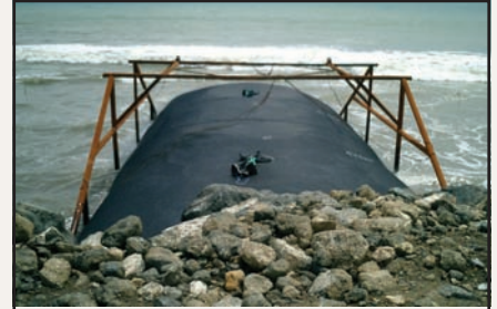
Geotube® unit being held in place by steel frame as it is filled.

Geotube® technology also allows great versatility in construction. Because units can be custom sized to various lengths and circumferences, less material may be needed. Also, because Geotube® units can be filled quickly in place, construction time can be reduced dramatically.