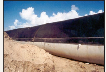
Protective cover shields Geotube® containers from sun's damaging UV rays.

Better yet, birds and other wildlife find the exposed Geotube® units ideal places to rest, sun, and fish.