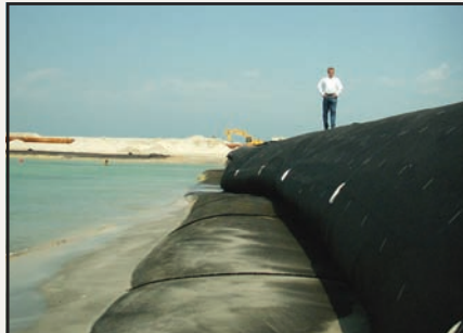
Geotube® containers are stacked to produce this protective structure.

Geotube® containers can be stacked several high to produce the elevation necessary for backfilling and land creation. The containers can then be covered with rip rap, sand, or other soil to hide them and produce natural looking shorelines.